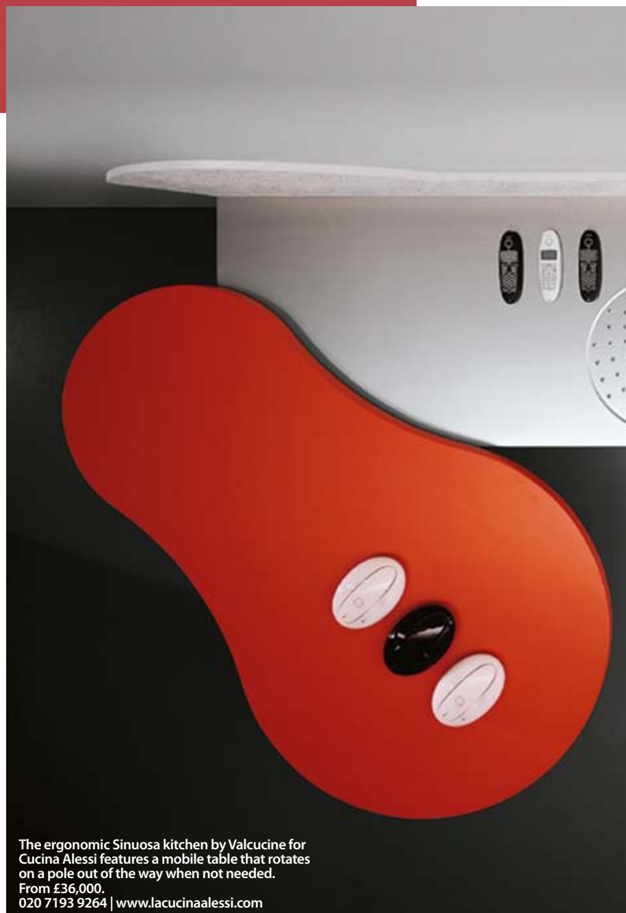
The ergonomic Sinuosa kitchen by Valcucine for Cucina Alessi features a mobile table that rotates on a pole out of the way when not needed. From £36,000. 020 7193 9264 | www.lacucinaalessi.com

E-cloth The star letter winner receives an E-cloth cleaning kit worth £100, delivering highly effective cleaning with just water. It includes the General Purpose E-cloth that is tough enough to remove even the thickest dirt, grease and bacteria from worktops and appliances without chemicals, leaving the surface perfectly clean and shiny. www.e-cloth.com