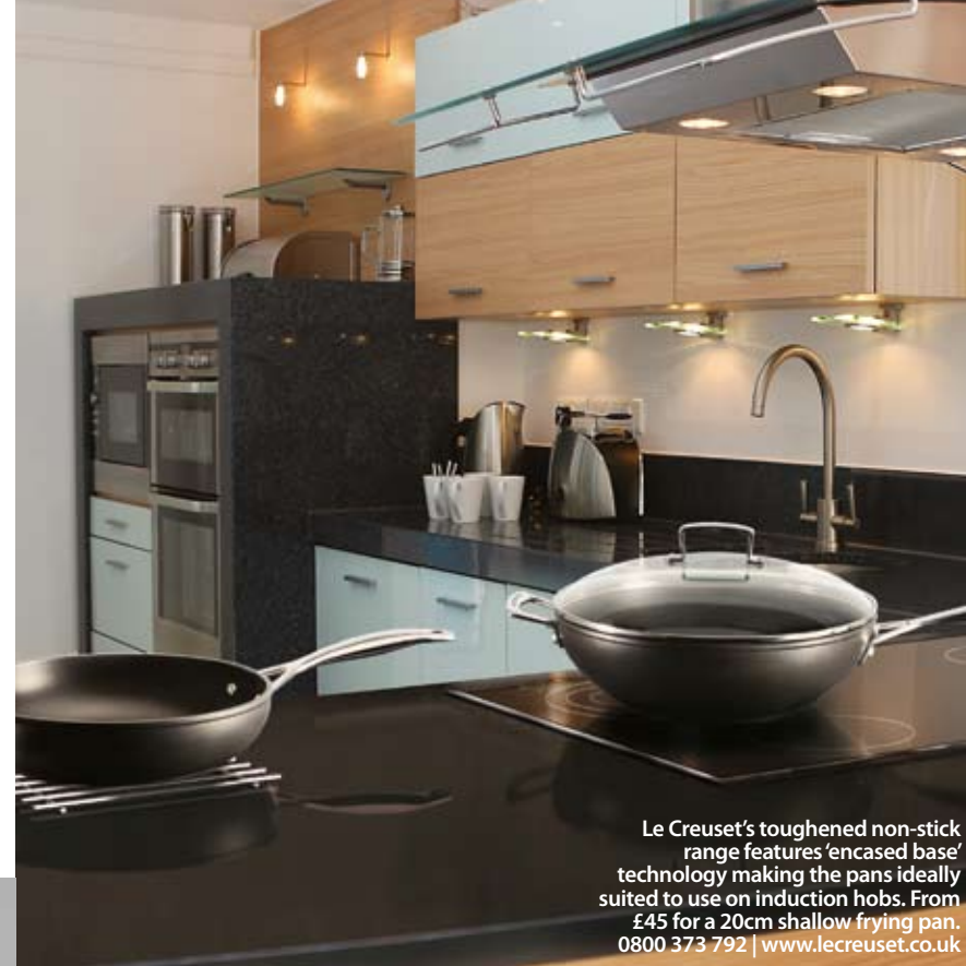
Le Creuset's toughened non-stick range features 'encased base' technology making the pans ideally suited to use on induction hobs. From £45 for a 20cm shallow frying pan. 0800 373 792 | www.lecreuset.co.uk