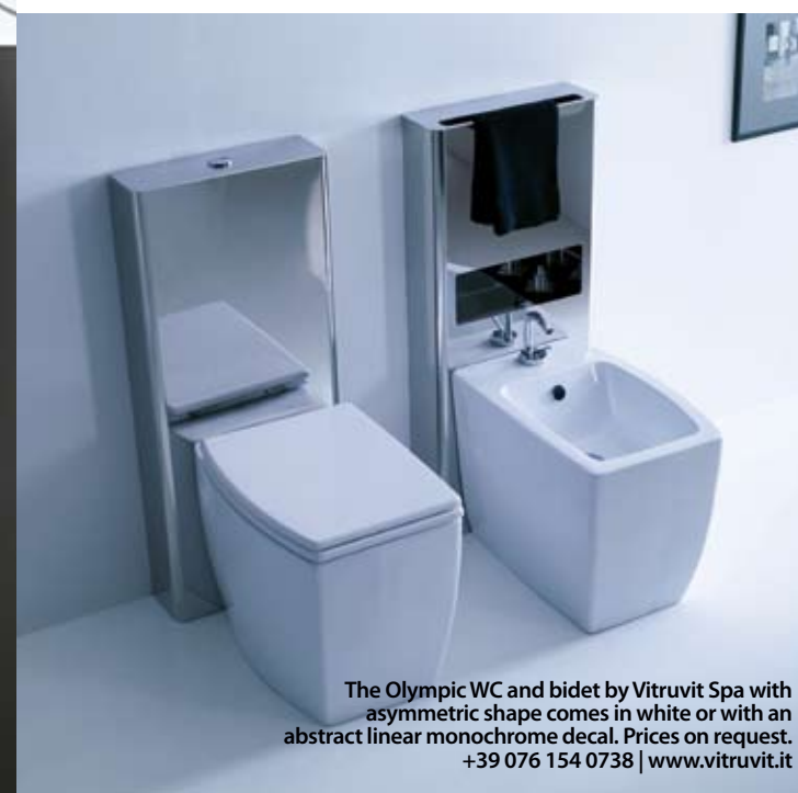
The Olympic WC and bidet by Vitruvit Spa with asymmetric shape comes in white or with an abstract linear monochrome decal. Prices on request. +39 076 154 0738 | www.vitruvit.it

A Firstly I'd try contacting the manufacturer to see if it has any, or even just replacement hinges or toilet bumpers – since these are the parts that often break, rather than the seat itself. Discontinued Bathrooms (0845 621 2223 | www.discontinuedbathrooms.co.uk ) and Goodwood (01243 532 121 | www.goodwoodbathrooms.co.uk ) stock a vast selection of shapes and sizes from various manufacturers, and the latter will even make to order. Otherwise try www.onlineair.com or www.bathroom-ceramics.co.uk for coloured seats.