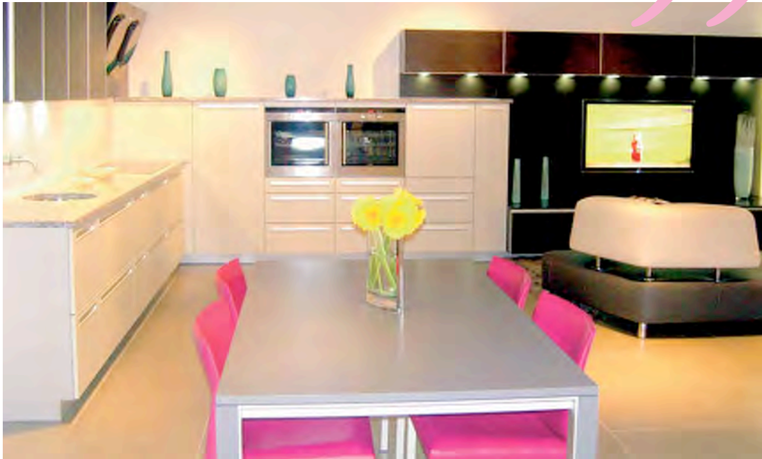
This perfect open plan living solution is created using the ALNO Look and ALNO Art Prime door ranges available exclusively from Moda Interiors, Dundee. For prices and other information call 01382 224557 or visit www.modainteriors.co.uk

The planning trend to create a family kitchen should accommodate much more than just cooking the Sunday roast. The kitchen has always been the heart of the home but now it's an interactive, multimedia social statement. It sets the style tone for the rest of the home.