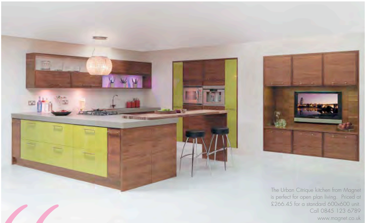
The Urban Citrique kitchen from Magnet is perfect for open plan living. Priced at £266.45 for a standard 600x600 unit. Call 0845 123 6789 www.magnet.co.uk

Consider more adventurous colours and perhaps a contrasting stone worktop or solid walnut, teak, zebrano or even bamboo, to contrast and add to the rest of the kitchen.